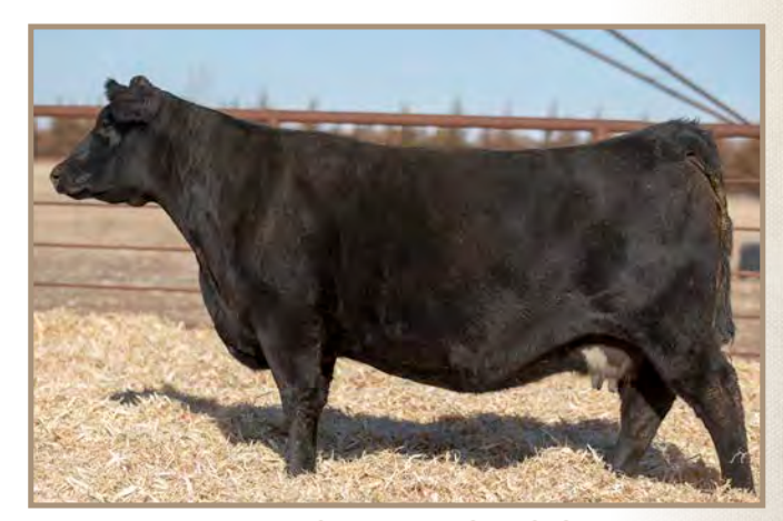
REFERENCE DAM BC MS C515

HOMOZYGOUS BLACK | 5/8 SM 3/8 AN. Very complete bull to start the SimAngus offering. Dam C515 is our main donor cow highlighting several previous bull sales with many wet daughters now in production to prove her worth. High seller in last year's sale sold to Trauernicht Simmentals. Extremely sound and athletic, yet powerful and wide based. Very practical, balanced EPDs across the board with top 25% API and TI. Sired by a tremendous herd sire from Sunflower Genetics in Kansas who we lost this past summer. Lot 40 traces back to the same cow (15P) as 9 other bulls in the sale.