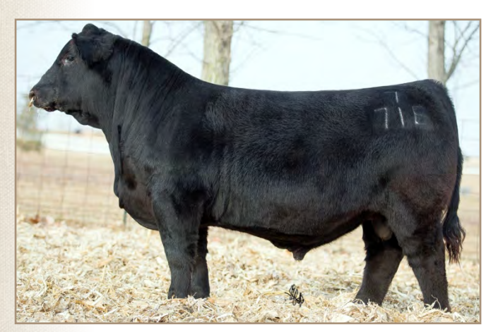
REFERENCE SIRE RUBYS TURNPIKE 771E

HOMOZYGOUS BLACK | 3/8 SM 5/8 AN. This Ace son has been a standout since he was born and one that everyone should consider. Extremely long sided and deep quartered bull with a great disposition. 79 pound birthweight then ratioed 115 WW 104 YW and REA 109. Top 10% of breed for WW, YW, and ADG. Top 25 API and 15 TI.