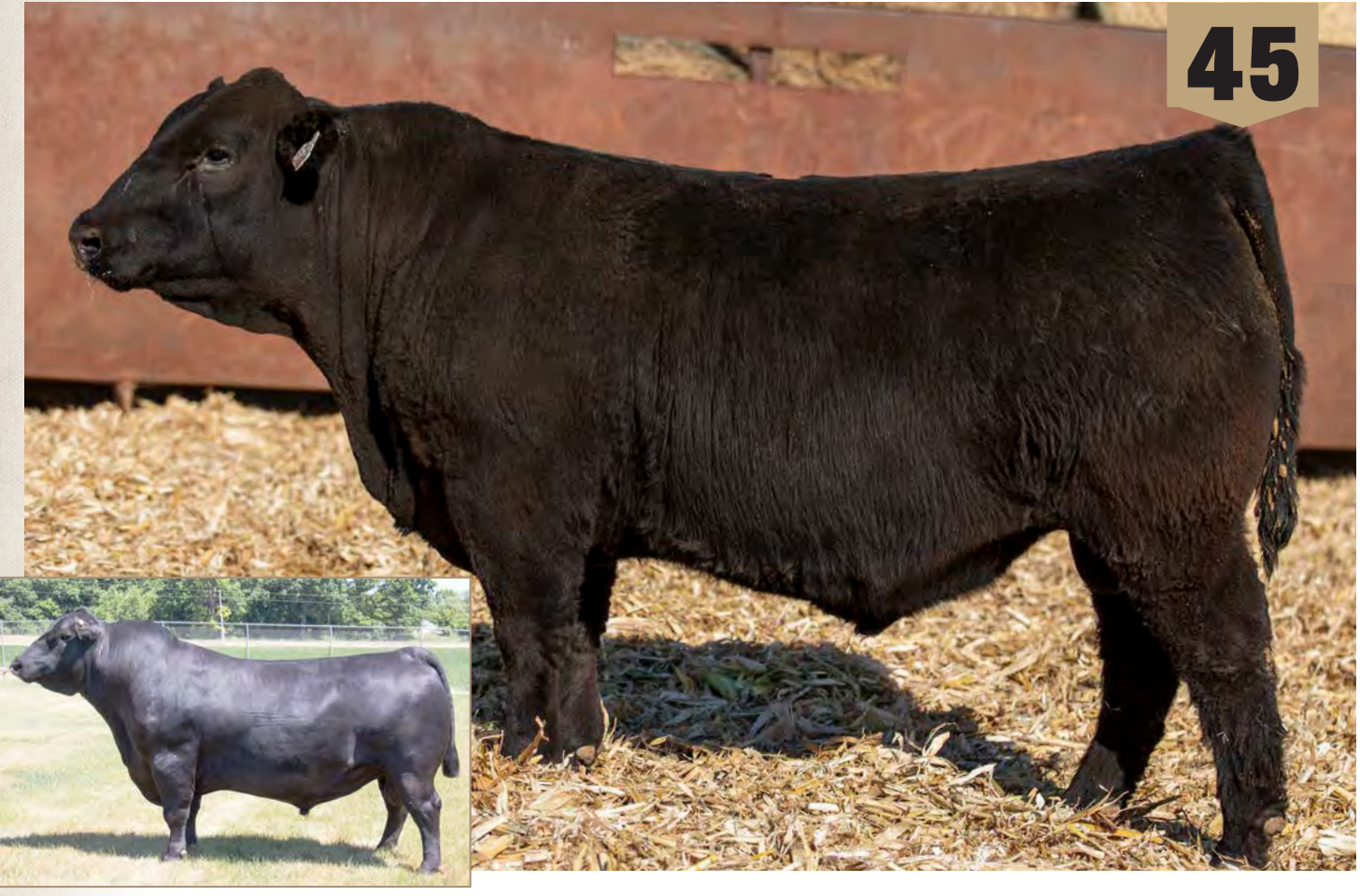
REFERENCE SIRE 4M ACE 709

MUSGRAVE AVIATOR 4M ACE 709 KGM ENCHANTRESS 4054