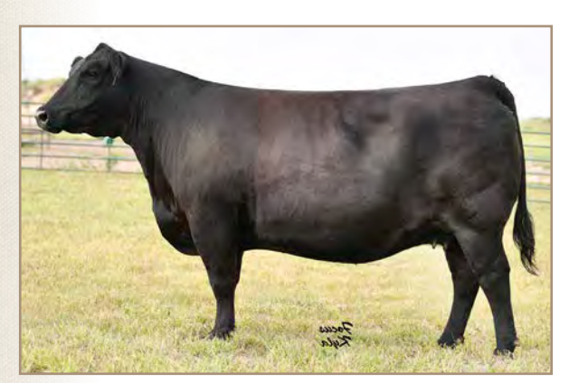
REFERENCE DAM CCC BLACKBIRD 1508

ANGUS <sub>GS</sub> Another heavy muscled Bank Note son that has extra shape and dimension all the way down through his lower quarter.