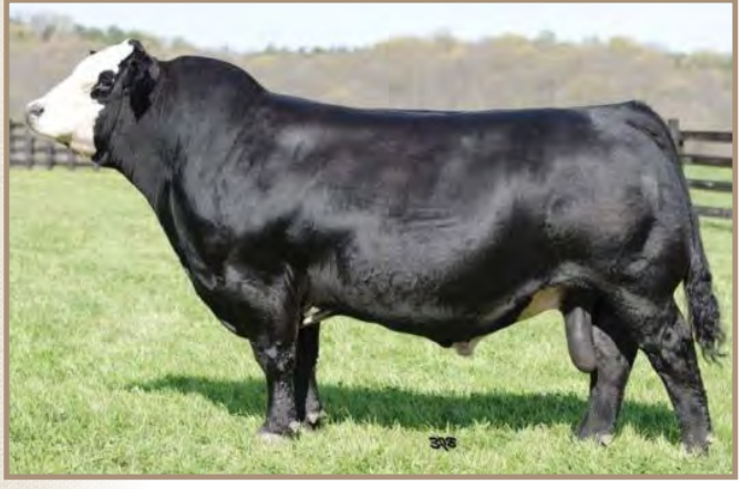
REFERENCE SIRE REMINGTON LOCK N LOAD 54U

REMINGTON ON TARGET 2S REMINGTON LOCK N LOAD54U BAR15 MISS KNIGHT78E-51G