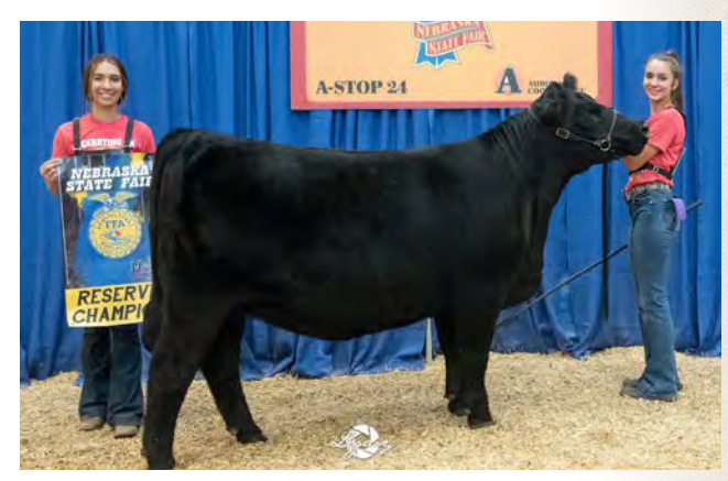
KLM Missie 9410 - Dam of Lot 35 Reserve Champion Angus Heifer at the 2020 Nebraska State Fair FFA Show