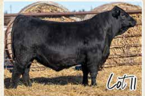
Hoffman Thedford x 4M Ace 709