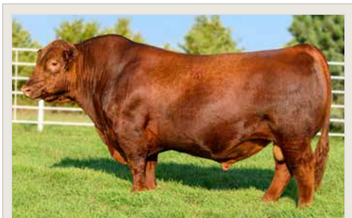
REFERENCE SIRE • PIE QUARTERBACK 789

1/2 SM 1/2 AR • Red Grindstone*A115 embryo mating was a popular group of bulls last year and this guy is no different. Wet embryo sisters are very impressive females. Negative -1.2 BW with plenty of growth.