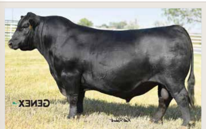
REFERENCE SIRE • DB Iconic G95

The one and only Iconic son in the offering out of the great 2004 cow. Iconic is another bull that will add carcass premiums and change that EPD profile in a single generation. I love the muscle and shape in this bull and how free and easy he moves about. Although this is the only Iconic in the sale, don't overlook this bull. The Iconic's are making very good mama cows and add a lot of value to one's herd.