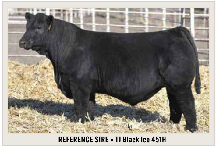
REFERENCE SIRE • TJ Black Ice 451H

5/8 SM 3/8 AN • Homozygous Black Deep, moderate Chief son that goes back to the 5102 Donor cow.