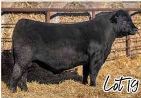
Sitz Accomplishment 720F x 4M Ace 709