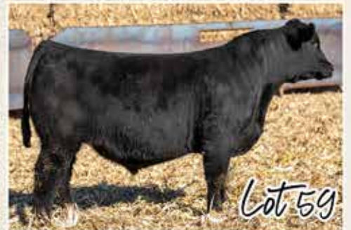
LBRS GENESIS G69 x SFG BACHELOR DEGREE B500