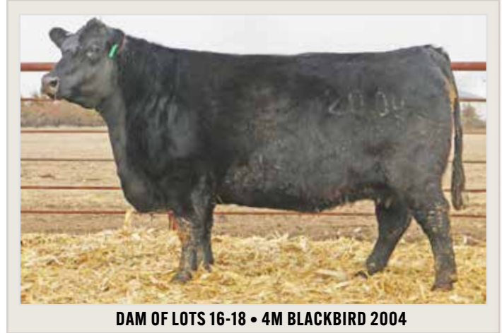
DAM OF LOTS 16-18 • 4M BLACKBIRD 2004