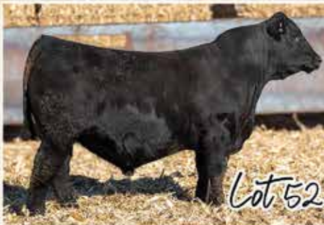
SQUARE B TRUE NORTH 8052 x BC1 MR. F810