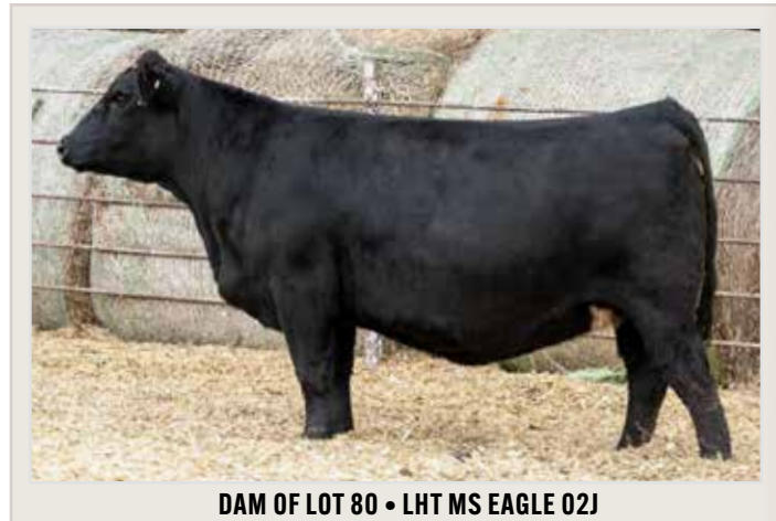
DAM OF LOT 80 • LHT MS EAGLE 02J

5/8 SM 3/8 AN • Homozygous Black Calving ease Homeland bull with high calving and a -2.7 BW EPD. Top 3% STAY, 15% MARB, and API. Ratioed a whopping 156 IMF.