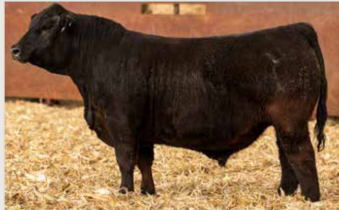
REFERENCE SIRE • BC1 STRUCTURE J111

1/2 SM 1/2 AN • Homozygous Black Another good Structure son with balanced EPDs and a 142 IMF EPD.