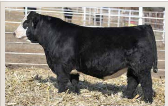
REFERENCE SIRE • TJ Chief 460G