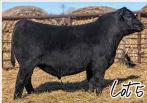
SITZ Incentive 704H x 3F Epic 4631