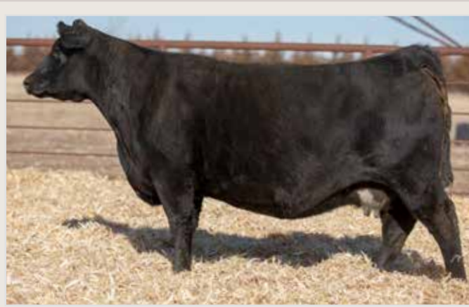
MATERNAL SISTER TO LOT 85 • BC1 MS C515

5/8 SM 3/8 AN • Homozygous Black Maternal sib to our 515 Donor. High carcass ratios of 121 IMF and 101 REA. Solid EPDs with top 25% MARB and REA and 15% API. Strong maternal figures as well.