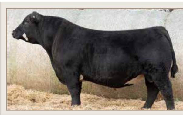
Reference Sire TJ WAR PAINT 759J ASA 3910125 by TJ CHIEF 460G