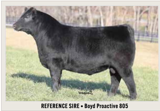
REFERENCE SIRE • Boyd Proactive 805