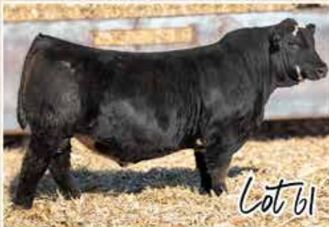
TJ WAR PAINT 759J x CCR BOULDER 1339A