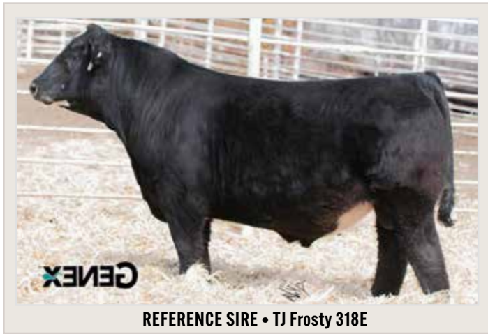
REFERENCE SIRE • TJ Frosty 318E

5/8 SM 3/8 AN • Heterozygous Black The highest performing Warpaint son. Top 1% and 2% in WW and YW EPDs. Ratioed 111 at WW and 103 for YW.