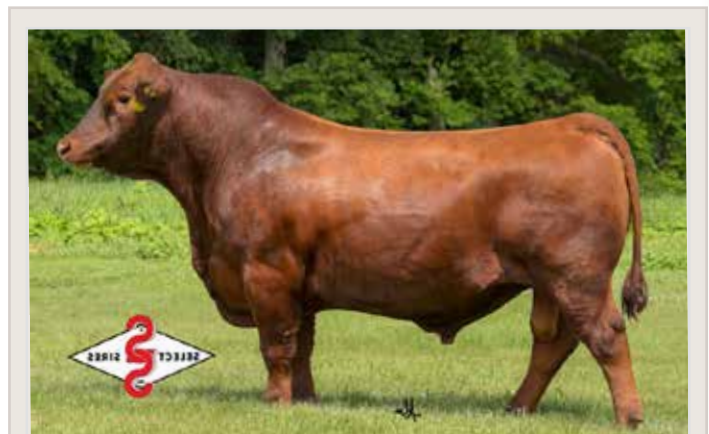
REFERENCE SIRE • HXC GRINDSTONE 9908G

5/8 SM 1/4 AR 1/8 AN • Red Major Moves*Merlin cross should make exceptional females and big feeders. High growth bull with top 3% WW, 10% YW and 2% REA. Ratioed 117 WW and 112 YW.