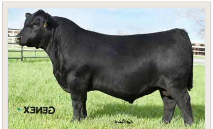
REFERENCE SIRE • Boyd Justification

A son of the Genex sire, Boyd Justification. These calves are low bw cattle with explosive growth! This bull has a ton of muscle shape and expression throughout and has a disposition that is as good as it comes. His 2 year old Jumbo dam has already entered the donor side and will have bulls for years to come in the sale. Her Craftsman bulls will be sure sale features in next years offering. Very, very good bull who is one of the younger bulls in the sale!