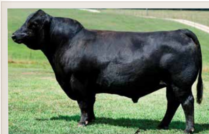
REFERENCE SIRE • CLRS HERDBOOK 316H

5/8 SM 3/8 AN • Homozygous Black An awful good Herdbook son. Smooth made, thick bull with impressive ratios of 102 WW, 105 YW, 110 IMF and 103 REA. 10 EPDs in the top 30% or better of the breed. Top 10% WW and 15% YW, 25% API.